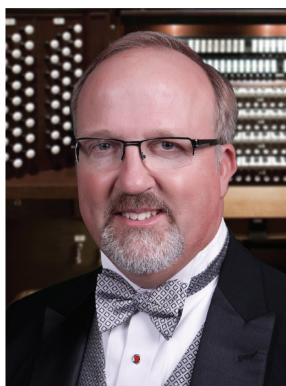
Seele Musicale Chamber Ensemble